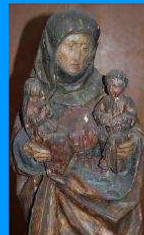
St. Anne, grandmother of Jesus